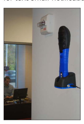
Remotely access units set up for continuous monitoring.

The GWLive Control Panel automatically formats to fit the internet accessible device that you log in with (via your password protected account). Review info from GrayWolf instruments at one or multiple locations. Select LIVE READINGS to access the data that logs at 1 minute intervals to the Cloud. View all tabular readings or Summary Data (e.g. last 8 hours, last 24 hours, last year). Display single Y graphs, or select "Multi-Y Graphs" or select "View Gauges" where "General", "WELL/LEED" or user defined Gauges can be set up to display. DEVICES allows you to perform various functions on remote GrayWolf instruments, and to access data/notes logged onto the devices. Export lets you send data to GrayWolf's WolfSense PC software for cut and paste reporting or optional WolfSense ARG for auto-report generation. Alternatively, export the data as a .CSV file to any device. ALERTS (if this option has been purchased), allows high/low points to be assigned for text/email notification.