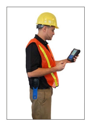
A Remotely access technicians' portable test meter data.