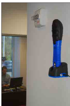
Remotely access ▲ units set up for continuous monitoring.

Access the full range of GrayWolf parameters via WiFi enabled AdvancedSense®, WolfPack®, WS-LAP PC or stand-alone Particulate meters. ▼