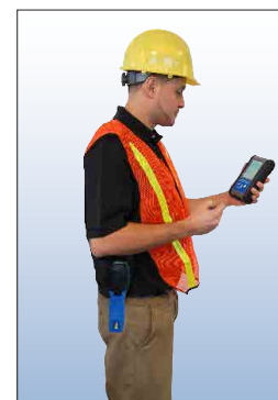
▲ Remotely access technicians' portable test meter data.