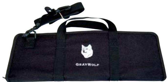
PCC-P504 Case (included with PIT-504-KIT)