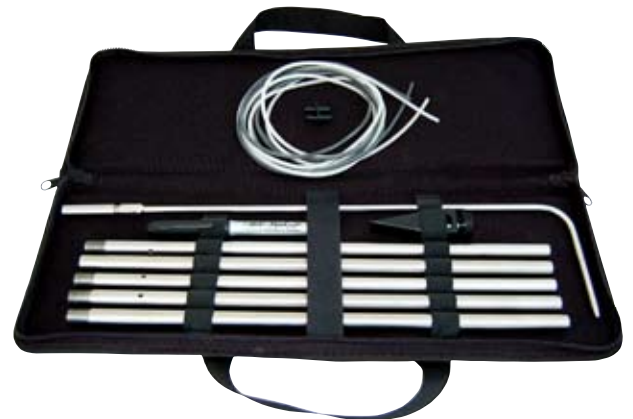
PIT-504-KIT (shown here with 2 optional extensions)

Available for use over an exceptionally wide air velocity and temperature range: airspeed testing up to 100 m/s (20,000 ft/m), at up to 800°C (1475°F).